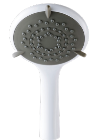
Inclusive Showerhead (5 Spray Pattern) TSHECAREWHT