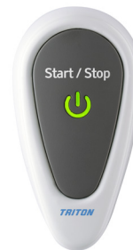
Remote Start / Stop CSGPRSS