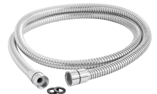
2m Anti-twist Hose - Chrome TSHG1266