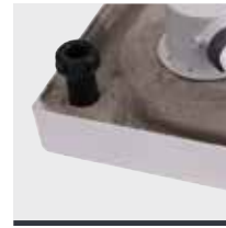
Graduated adjustable leg system