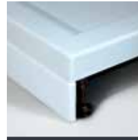
Adjustable legs & tray panel kit