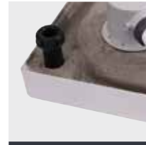
Graduated adjustable leg system